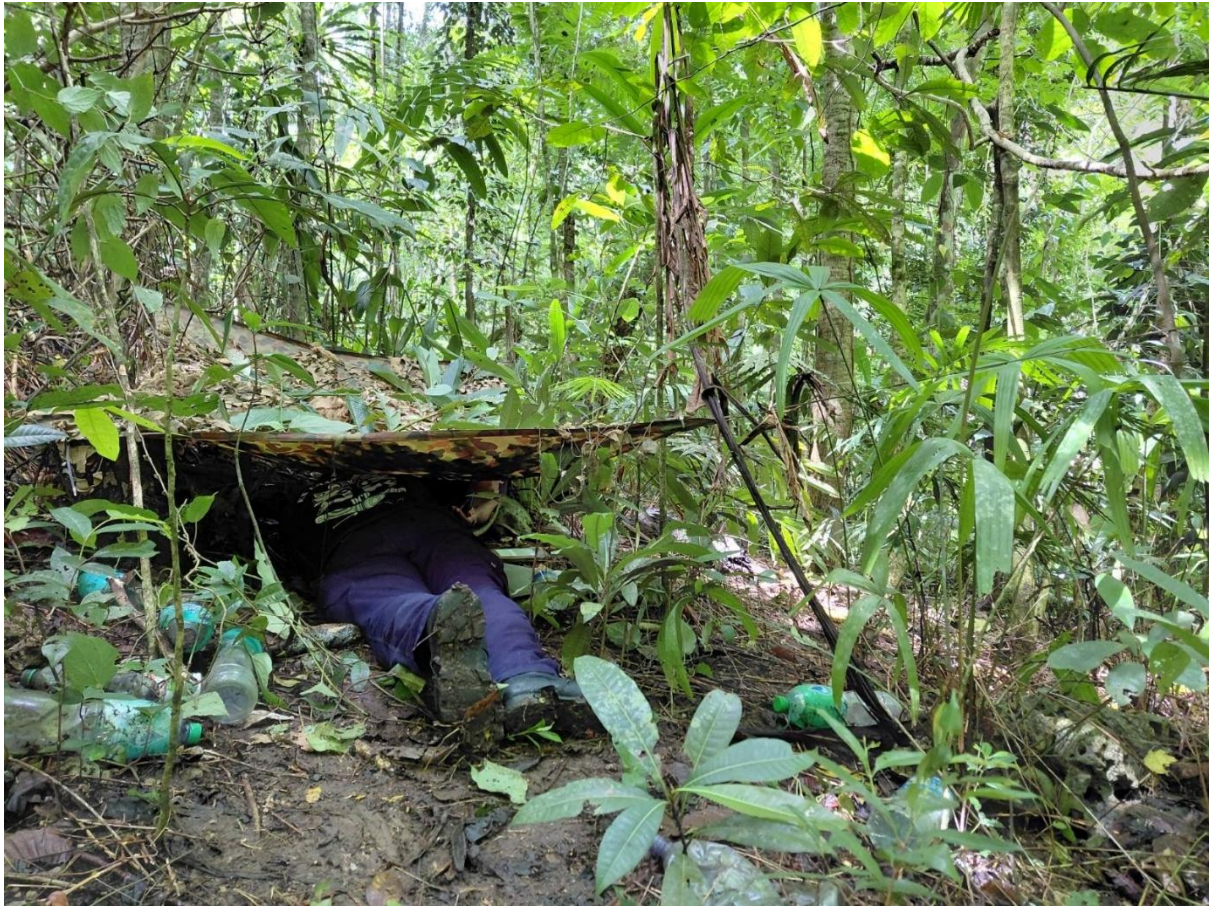
Photo 4: RSIPF member operating from an observation post on the Advanced Border Surveillance Course