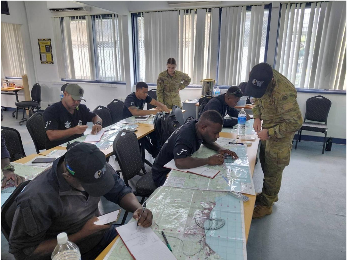
Photo 6: RSIPF and ADF members planning a patrol as part of the Advanced Border Surveillance Course.